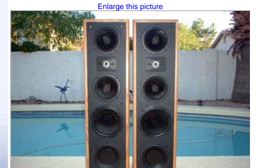
Enlarge this picture